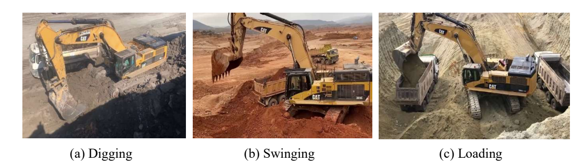
Figure 2: Samples from the Collected Dataset.