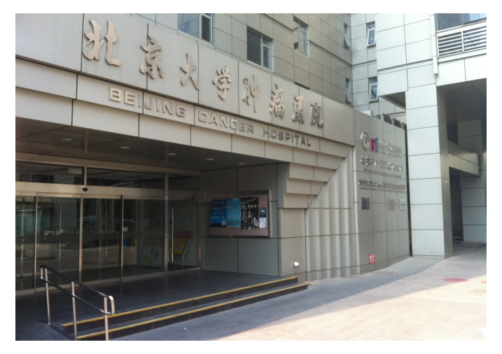
Picture 3: Breast Center, Beijing Cancer Hospital, Peking University Cancer Hospital(BC)

Remembering what my contact doctor had told me, I proceeded to a building at the back of the hospital. Here an entrance sign said "Beijing Cancer Hospital". I quickly went inside and took the lift to the 6<sup>th</sup>floor, which was to become not only my place of research in the following months, but also what I later learnt, one of the important sites for the unfolding practice of genetic risk estimates in China.