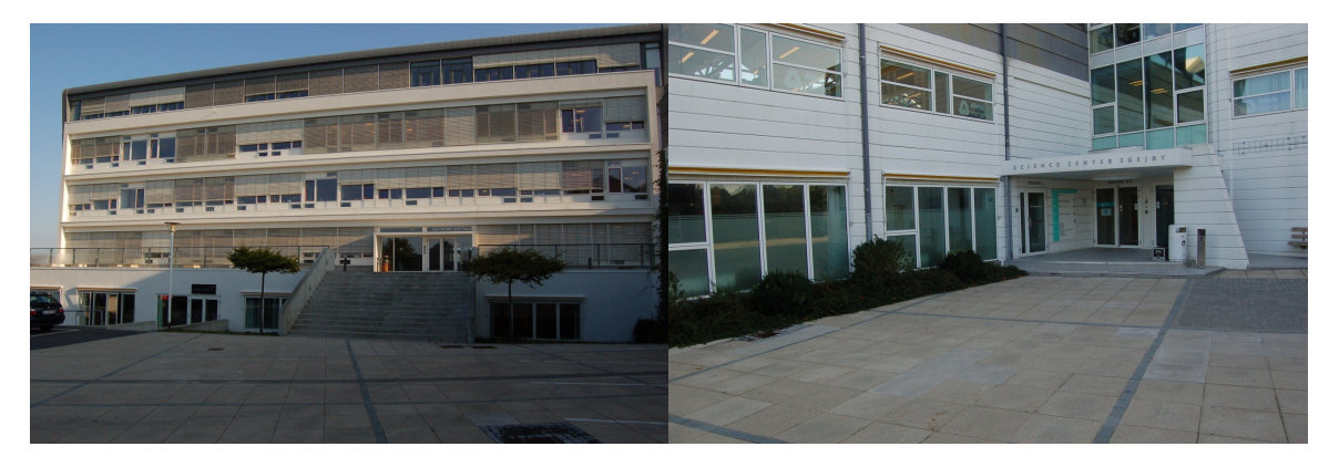
Pictures 7-8: Aarhus University Hospital's Department of Clinical Genetics (DCG), Denmark

Aarhus University Hospital's Department of Clinical Genetics (DCG) in Denmark also offers genetic services at two locations outside the main facility, in Herning and in Viborg. These two offices are not situated at a specific clinical genetics department, but are physically located at other departments. During my fieldwork, I participated in genetic counseling both in Herning and in Viborg, although the major part of my fieldwork was concentrated at the main facility in Aarhus.