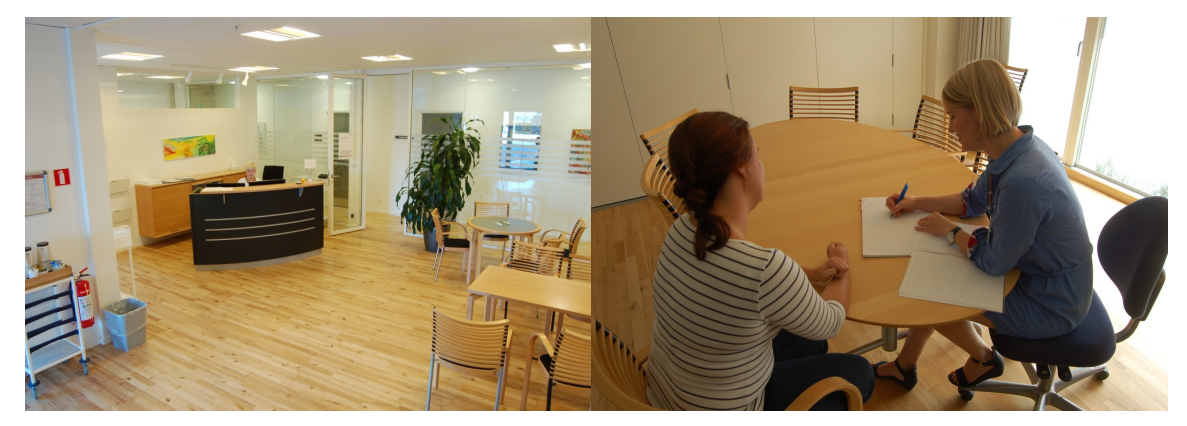
Pictures 9-10. Danish outpatient clinic, waiting room and examination room

In the waiting area, there are two small desks and toys for children. A few chairs are placed in the room to accommodate those waiting. I seldom experienced this room to be crowded, and the outpatient clinic was always a quiet place.